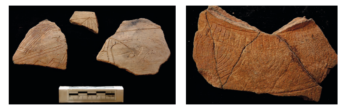
Figures 3a, 3b. — Pottery at Hồ Điều Hòa and Chùa Cầu sites.

Note that one fragment of fine buff ware was decorated with a lotus motif. Also that another fragment was decorated with an animal motif (only some parts of the animal are visible — it