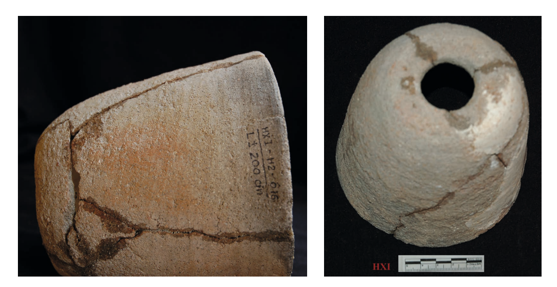
Figures 1a, 1b. — Pottery at Hậu Xá I settlement.

Regarding dating, the lower layer may be dated to the late 1st century or early 2nd century CE. This estimate is based on comparative analysis: we recognised here types of pottery similar to those found in Trà Kiệu (Duy Trung village, Duy Xuyên district, Quảng Nam province) Lower Layer (but not the lowest layer, according to Yamagata Mariko's chronology, where ovoid jars and tiles with textile impressions were found), also in Gò Cấm (Duy Trung village, Duy Xuyên district, Quảng Nam province) Upper Layer and in Cổ Lũy (Phú Thọ village, Nghĩa Phú commune, Tư Nghĩa district, Quảng Ngãi province) Lower Layer. We also recognised the close spatial and temporal relations between this early Linyi/Champa site and other Sa Huỳnh sites such Hậu Xá II (Cẩm Hà village, Hội An town, Quảng Nam province), An Bang (Cẩm Hà village, Hội An town, Quảng Nam province), dating from the 1st century BCE to the 1st century CE.