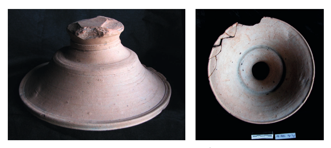
Figures 2a, 2b. — Pottery at Ruộng Đồng Cao site.

Most of the artefacts are potsherds derived from cooking pots, jars, kendis , bowls, dishes, eaves tiles decorated with human faces, bricks; bronze dishes and glass beads were also present. Jars and kendis are decorated with stamped patterns and symbols that resemble Chinese characters. Some lids bear incised decorative patterns in the shape of cycles and waves. One fruit tray (in fine fabric pottery) with a high foot was uncovered during the 2009 excavation (see Figs. 2a, 2b).